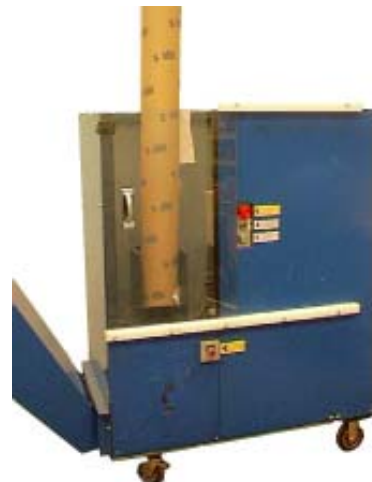
6" & 3" CORE EATER

Cores are placed in the top of the 3" model and on the side of the 6" model, after all white waste, plugs and caps have been removed. After the core has been completed, the machine will stop unless another core has been placed on top of it. Feed rate is between 2' & 8' per minute based on style chosen.